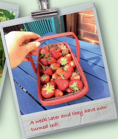
A week later and they have now turned red!