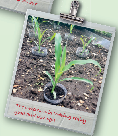
The sweetcorn is looking really good and strong!!