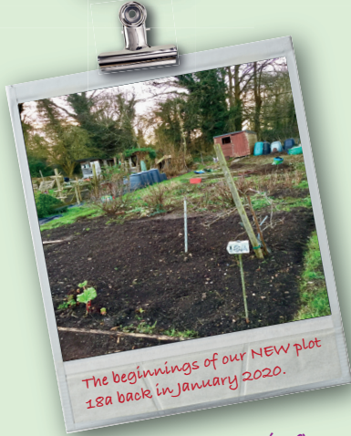
The beginnings of our NEW plot 18a back in January 2020.

Lots of clearing & digging which we have now finished.