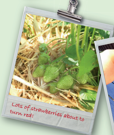
Lots of strawberries about to turn red!