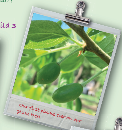
Our first plums ever on our plum tree!

This is the 'Wizard's Hat' a propagator designed & built by my dad & is working great for all my young squash plants going in!