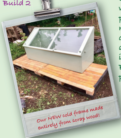
Our NEW cold frame made entirely from scrap wood!