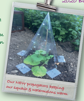
Our NEW propagators keeping our squash & watermelons warm

This is the 'Wizard's Hat' a propagator designed & built by my dad & is working great for all my young squash plants going in!