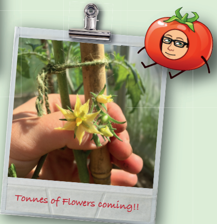
Tonnes of Flowers coming!!

I am really excited to see how much produce I get towards July and August and see if this year we can get some watermelons like we did 2 years ago. Stay safe, stay healthy and carry on Gardening!